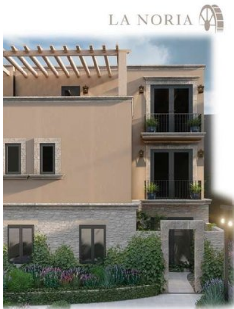
PROYECTO RESIDENCIA 11