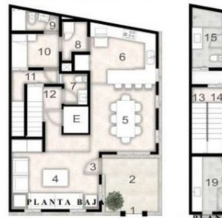
PROYECTO RESIDENCIA 11