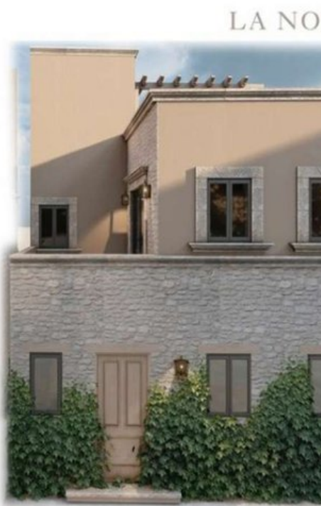
PROYECTO RESIDENCIA 15