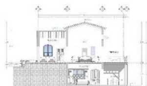
CORTE TRANSVERSAL A-A'